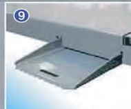
Removable work platform

The hydraulic safety valve prevents rapid descent of the hoist regardless of total hydraulic hose failure.