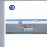
Dual stage descending system

Stable structure / precision leveling making hoist highly compatible for 3D alignment.