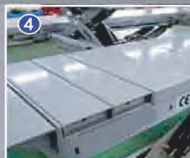
Turn table adjustable plates

Easy glide rear slip plates with auto air operated locking device.