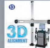
3D Alignment compatible

Height adjustable ramps compensate for uneven workshop surfaces.