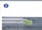
Height limit sensor

Twin hydraulic cylinders provide accurate lifting via a new smart electronic synchronisation system