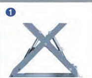
Twin hydraulic Cylinders

Twin hydraulic cylinders provide accurate lifting via a new smart electronic synchronisation system