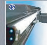
LED lighting kit

A second descent sensor is fitted as a safety feature at 150mm above ground the hoist briefly stops and an alarm sounds upon final descent.