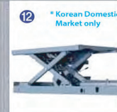
Platform lift tables

A long platform is suitable for 3D wheel alignment, and enable a variety of vehicles such as vans and long wheel based cars to fit on hoist.