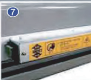
Jacking bridge switch

2 x 2500Kg electric/hydraulic jacks shown above with optional pads & adaptors.