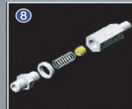
Hydraulic safety valve

Jack switch is mounted on the inner side of the platform providing protection to the switch and adding safer operation to the user.