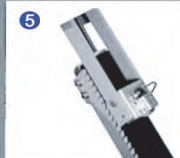
Ratchet type locks

Drop in adjustable plates allow custom placement of alignment turn tables, and double up as platform continuation when plates are not in use